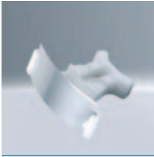
Convexly formed blade

Cutting head and blade are designed in a convex form similar to the cornea itself. Due to the unique pendulum motion of the Carriazo-Pendular, the cornea becomes more applanated in the center than in the periphery. This is the only way to ensure a uniform as well as precise cut. Combined with the optimal settings for cutting speed and blade oscillation, this technology provides a homogeneous and highly predictable flap thickness and very smooth cutting edges. Even very thin cuts can be performed in an extraordinarily reliable way.