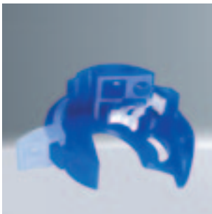
Innovative blade box

The Carriazo-Pendular not only impresses with a very low standard deviation between 10 and 12 \mu\text{m} . Considering the mostly neglected limit values like minimal and maximal flap thickness, the expected maximal flap thickness values are well within a safe range for the operator. These results are obtained by means of detailed monitoring and the specific interaction of blade and cutting head manufacturing tolerances.